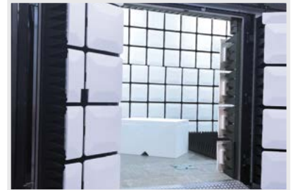
UH Absorbers (shown with white caps) in a Fully Compliant 3m chamber